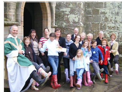
Showing Off Their Wellies*