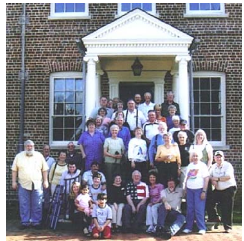
Convention Attendees at Belair Mansion