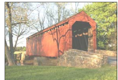
Loy's Station Covered Bridge

Saturday saw presentations on the 2008 Northumberland trip, the status of the St. Maurice (Eglingham, England) Ogle Chapel Reordering Scheme. The Ogle Chapel has now been refurbished as part of the overall restoration efforts at St. Maurice, and was dedicated this past Easter. There were more sharing and discussion sessions, including the formation of small groups to explore specific regional Ogle research questions.